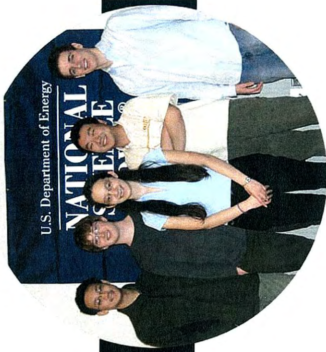
2006 State College