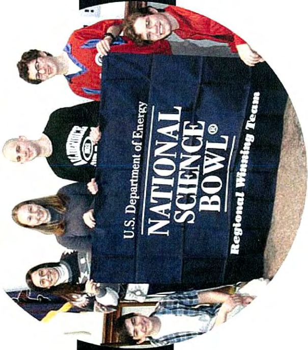
2003 Taylor Alderdice