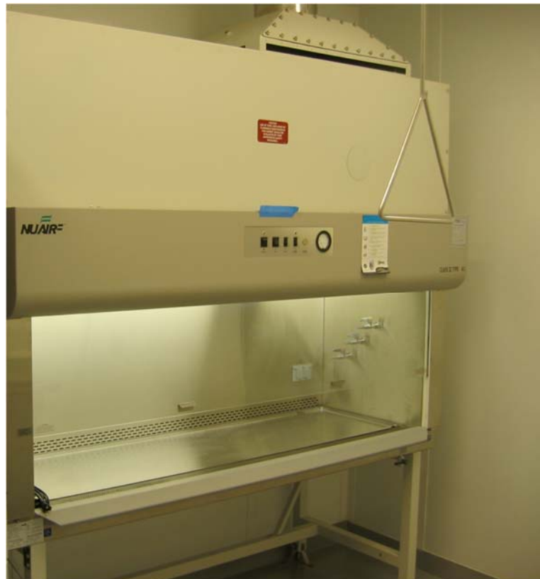
Figure 2-1. NUAIRE Class II, Type A2 Biosafety Cabinet<sup>2</sup>

Safety equipment may also include PPE such as gloves, coats, gowns, shoe covers, boots, respirators, face shields, and safety glasses or goggles. PPE is often used in combination with BSCs and other devices that contain the agents or materials being handled. In some situations in which it is impractical to work in BSCs, PPE may form the primary barrier between personnel and the infectious materials. Examples include agent production activities, and activities relating to maintenance, service, or support of the laboratory facility.