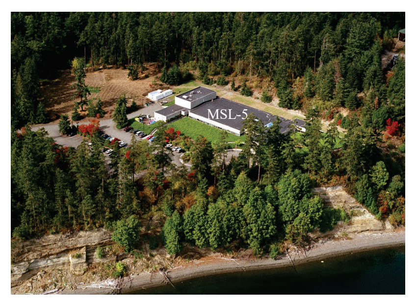
Figure 1.5. MSL-5 Building