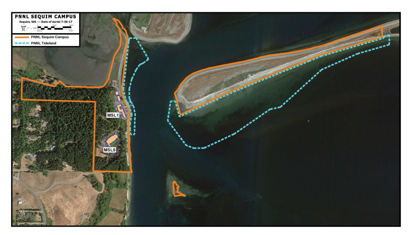
Figure 1.2. PNNL Sequim Campus including Tidelands

The PNNL Sequim Campus is shown in Figure 1.2 and Figure 1.3. The boundary is consistent with the Master Plan for DOE operations at the PNNL Sequim Campus (PNSO 2020). The entire PNNL Sequim Campus as presented in this report encompasses 117 acres of dry lands (65 ac) and tidelands (52 ac), of which about 7.5 acres has been developed for research operations.