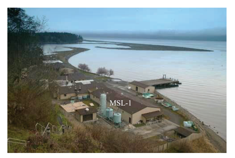
Figure 1.4. MSL-1 Building