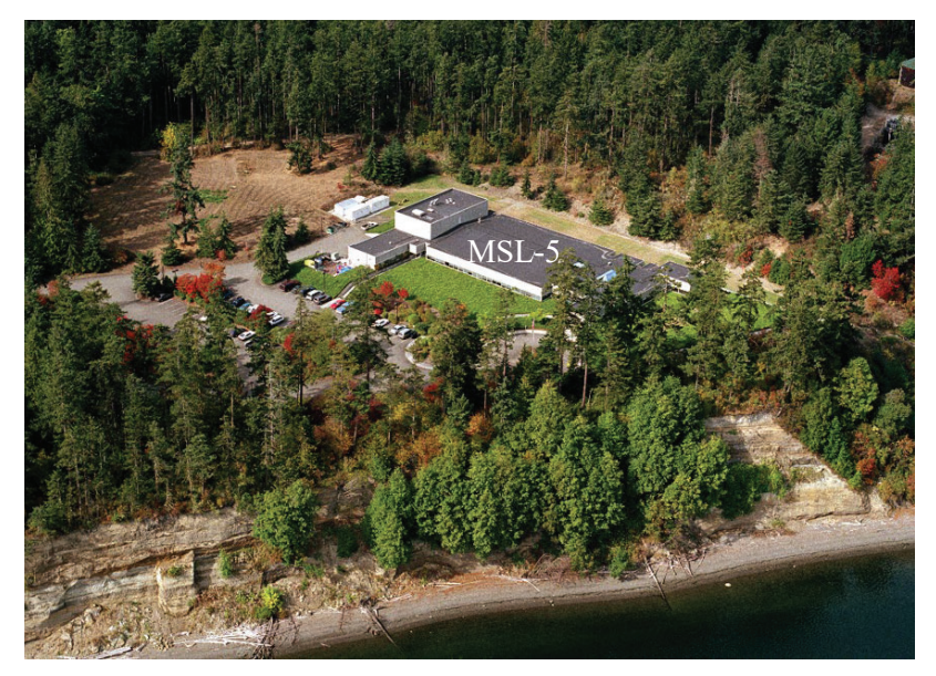
Figure 1.4. MSL-5 Building