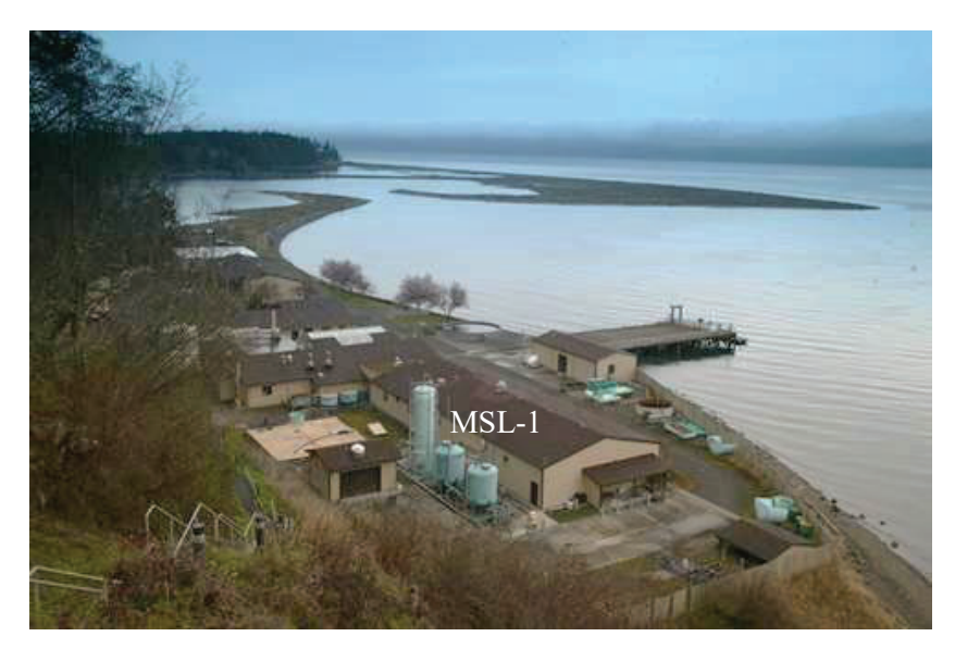
Figure 1.3. MSL-1 Building