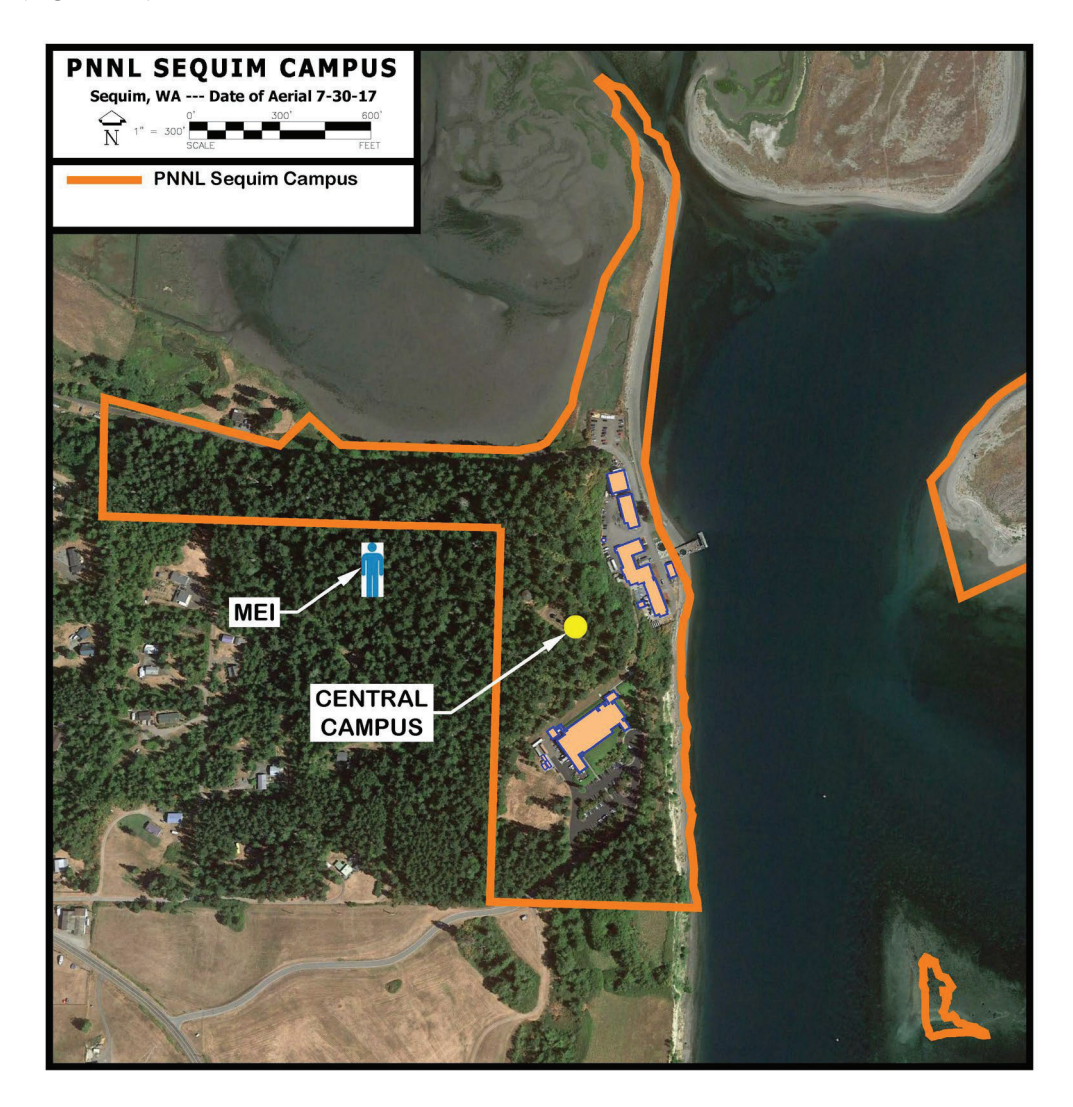
Figure 2.1. PNNL-Sequim Campus with Central Campus and 2022 MEI Location Identified

This section describes the registered PNNL-Sequim Campus emission unit operations during CY 2022. Information regarding the radionuclides of concern, emission rates, and emission unit physical characteristics are described. All emissions are assumed to be released from a single, Central Campus location (Figure 2.1).