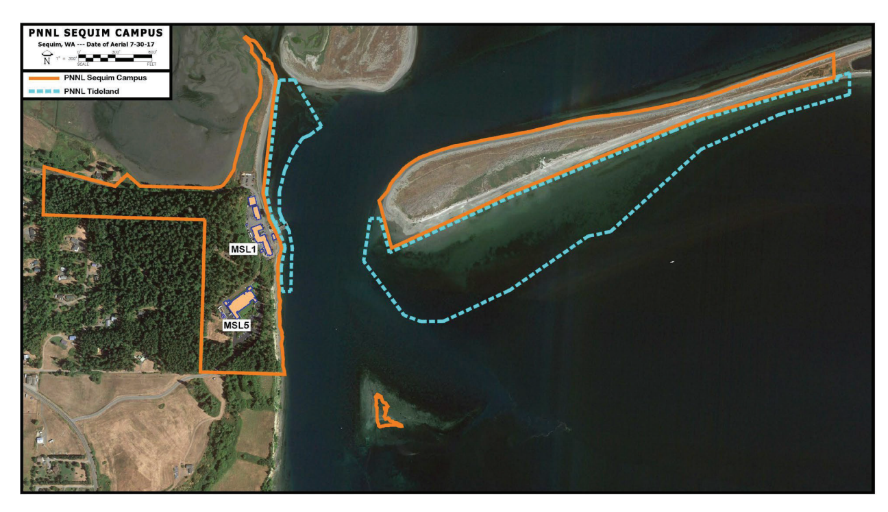
Figure 1.2. PNNL-Sequim Campus including Tidelands

The PNNL-Sequim Campus is shown in Figure 1.2. The boundary is consistent with the Master Plan for DOE operations at the PNNL-Sequim Campus (PNSO 2020). The entire PNNL-Sequim Campus as presented in this report encompasses 117 acres of dry lands (65 ac) and tidelands (52 ac), of which about 7.5 acres has been developed for research operations.