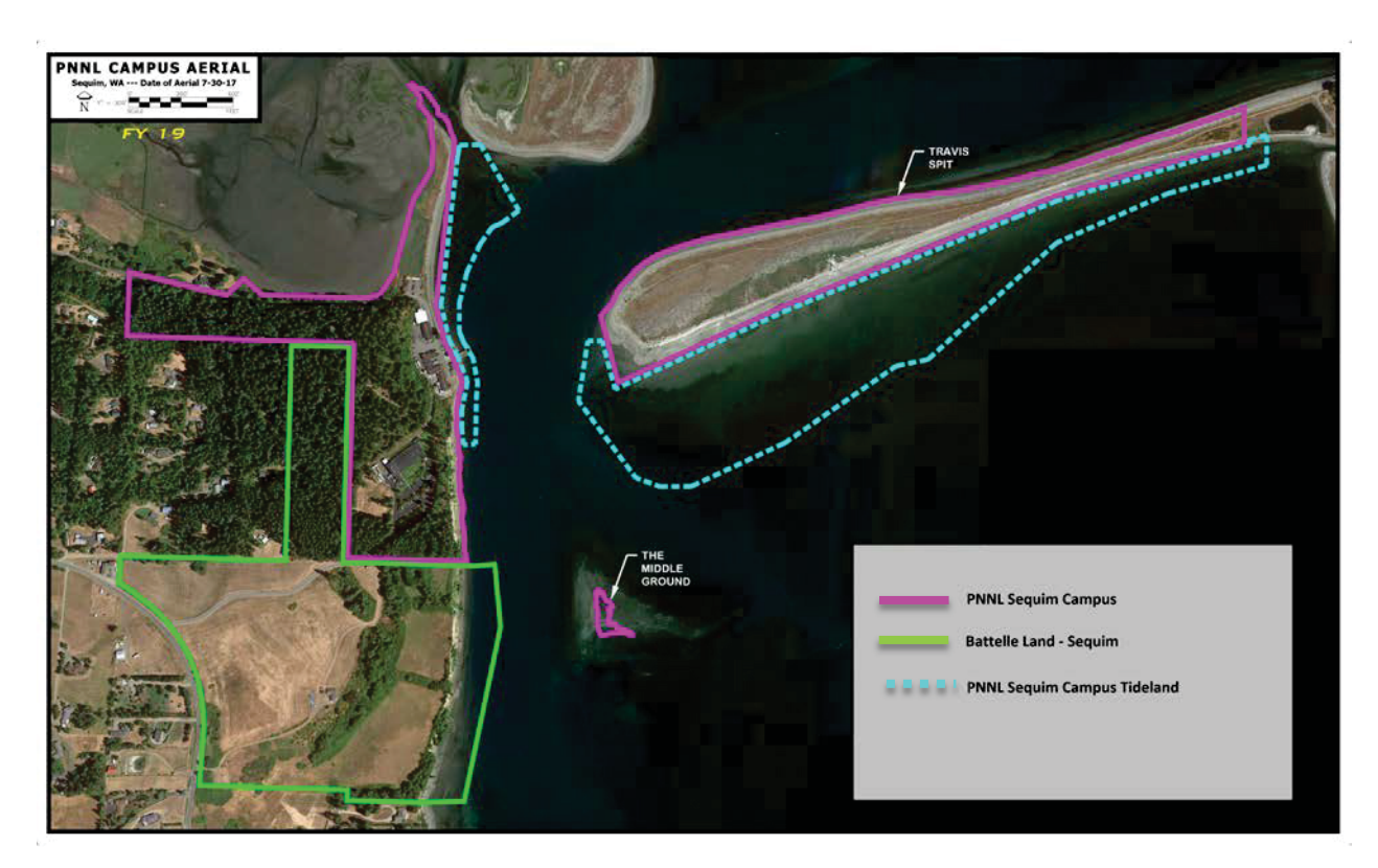
Figure 1.2. PNNL Sequim Campus and Battelle Land-Sequim