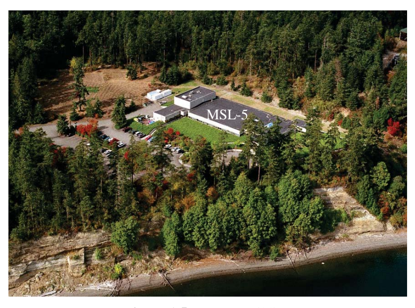
Figure 1.5. MSL-5 Building