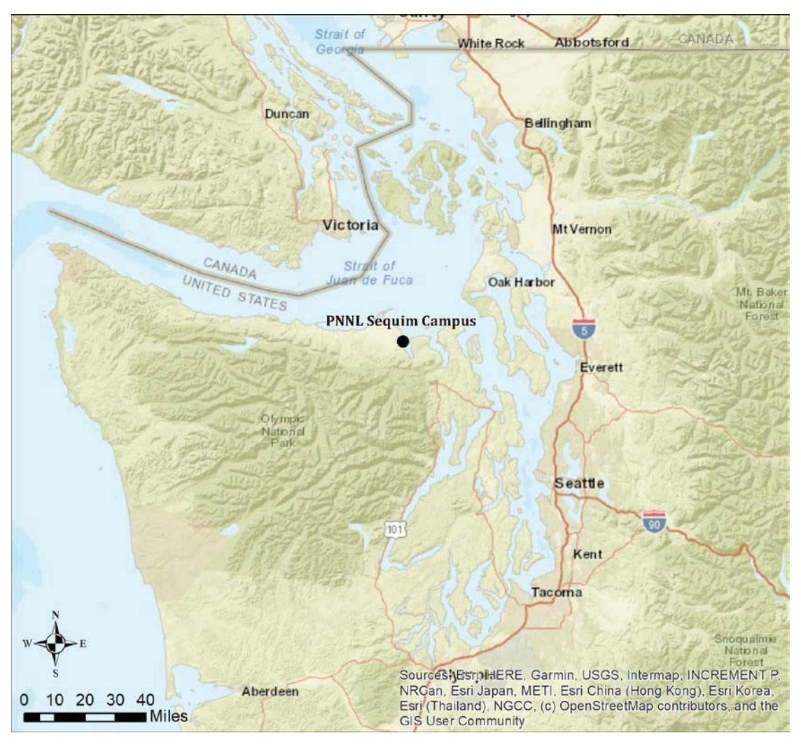
Figure 1.1. PNNL Sequim Campus in Northwestern Washington State

This radiological air emissions report meets the Washington Department of Health (WDOH) requirements for radiological National Emission Standards for Hazardous Air Pollutants (NESHAP) compliance reporting for the activities at the PNNL Sequim Campus for calendar year (CY) 2019. Site air effluent emissions are governed under WDOH Radioactive Air Emissions License (RAEL)-014, Renewal 1. Compared to the prior year, radiological laboratory activities have not changed.