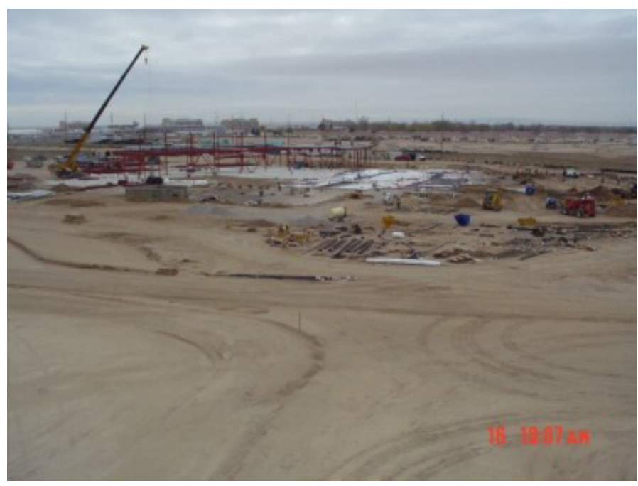
10/21/04 – Progress of Slab Work