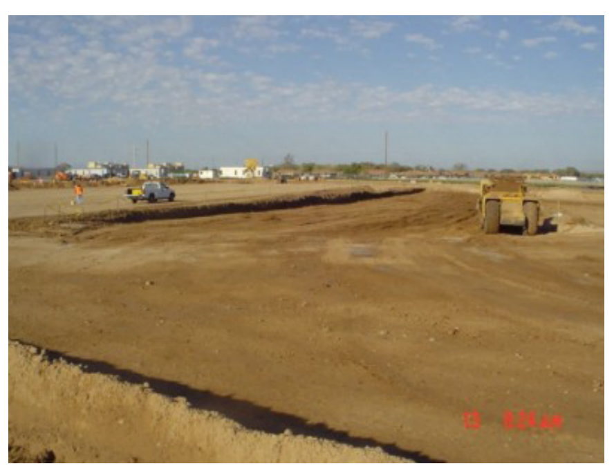
View of Worksite