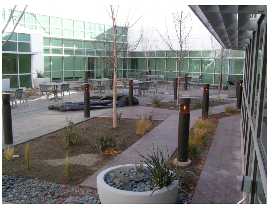
12/22/05 – View of Courtyard