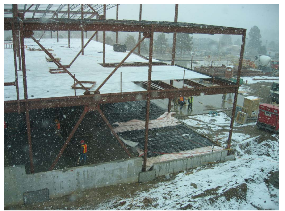
Southwest Corner of Building March 2005