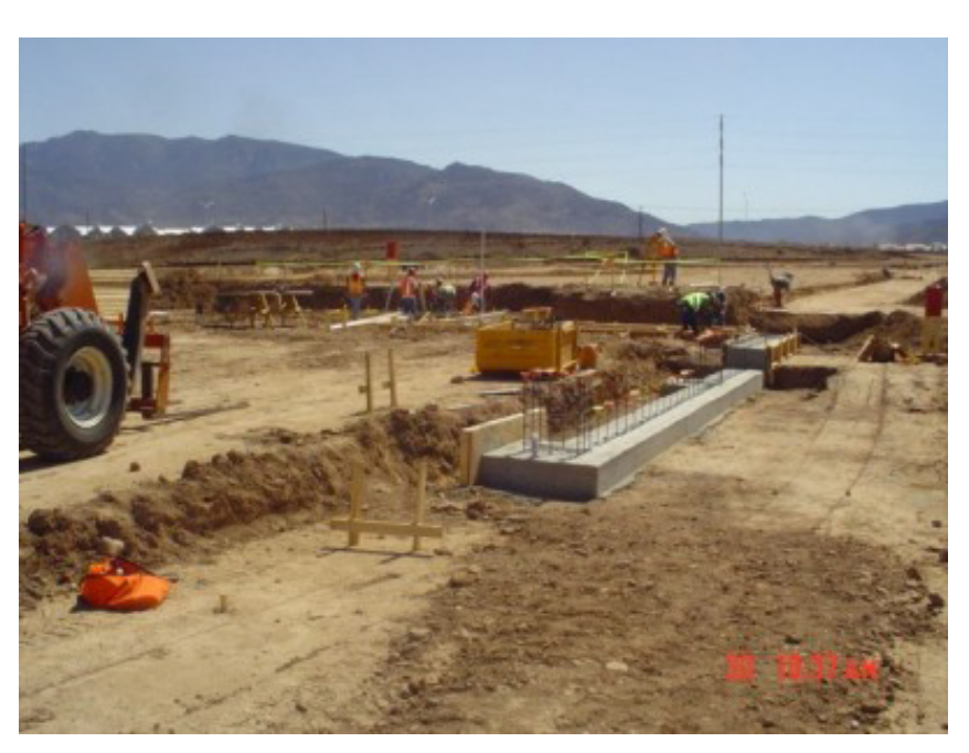
7/30/04 Start of Footings