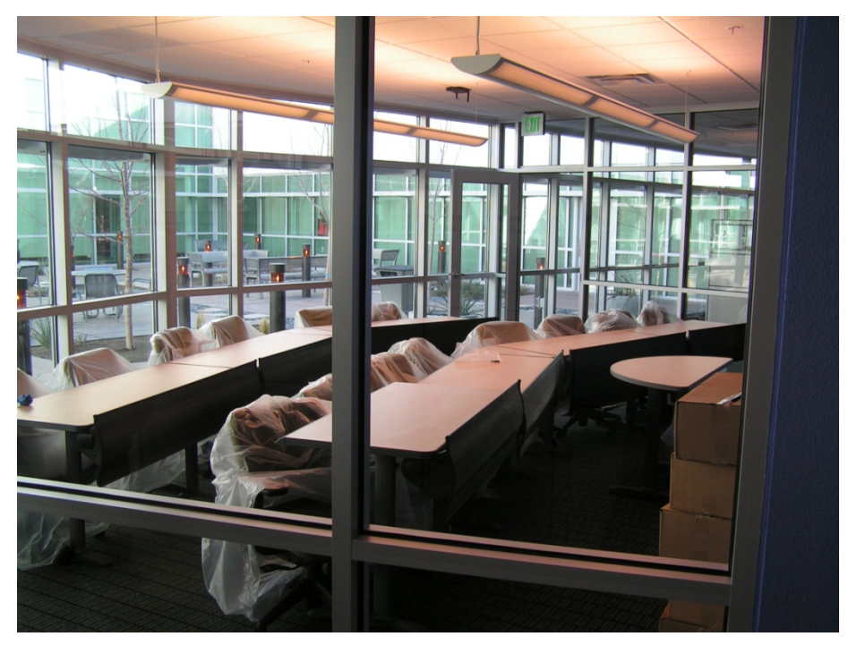
12/22/05 – View of Conference Room