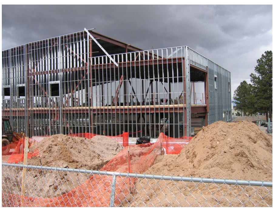
Stud Work April 29, 2005