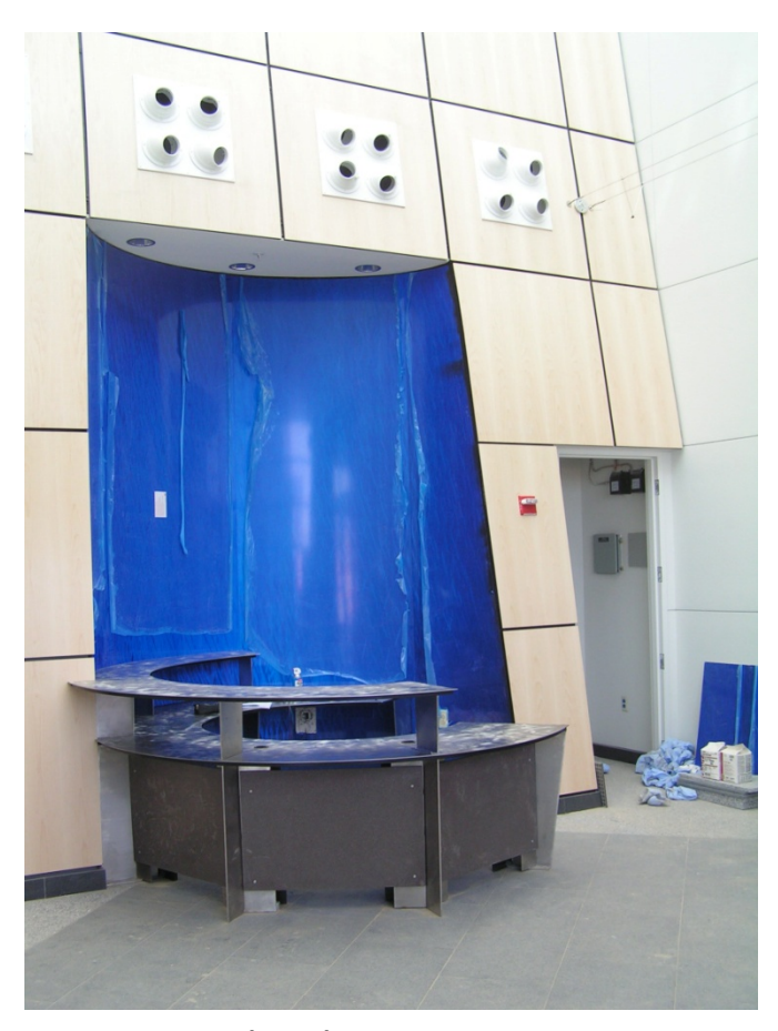
12/22/05 – View of Reception Area