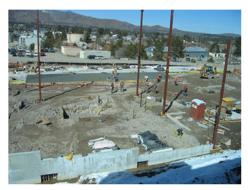
Pouring Concrete February 2005