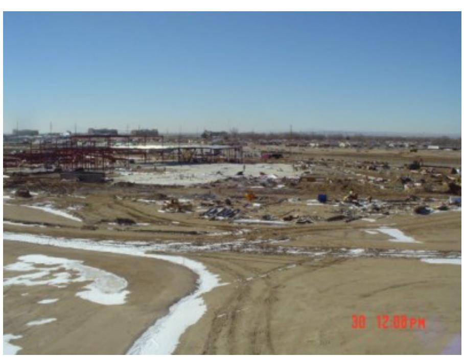
11/30/04 – View of Work Site