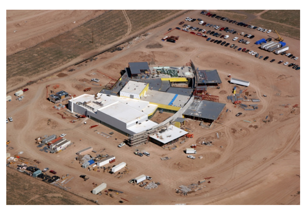
April 2005 – Aerial View of Worksite