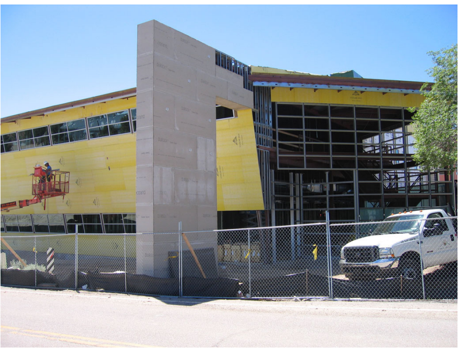
Job Site June 2005