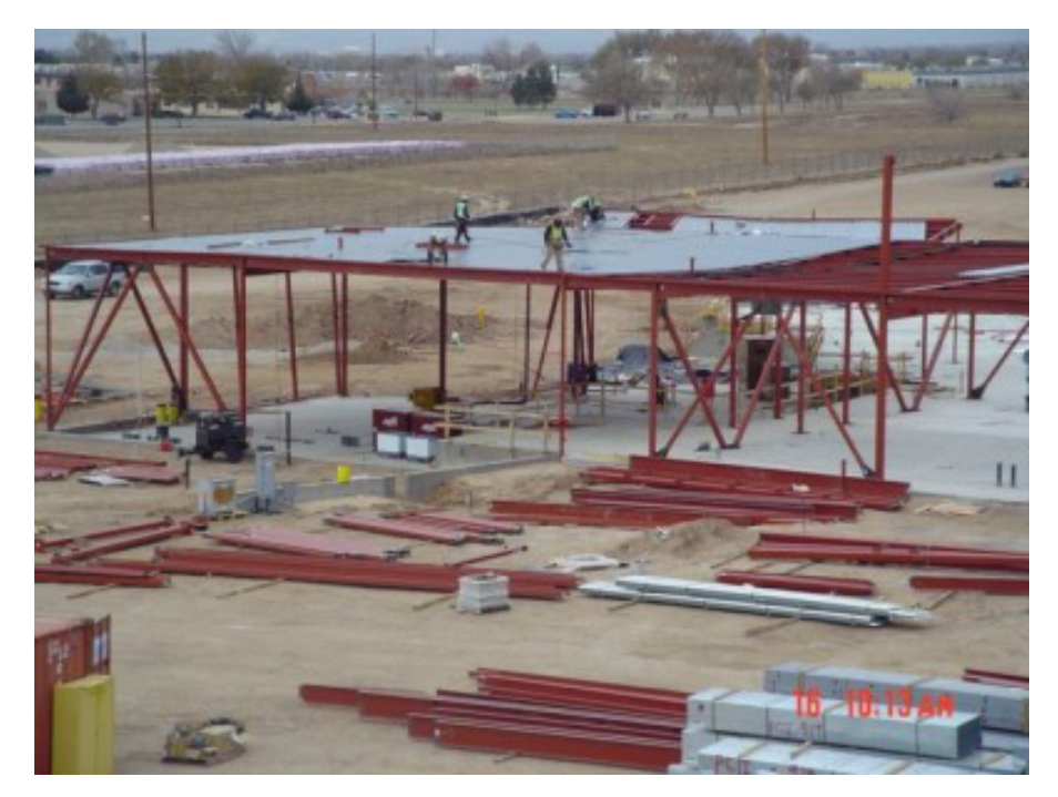
11/16/04 – Steel Beam Work