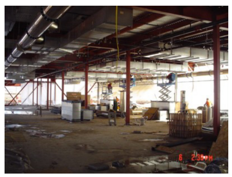
1/06/05 – View of Duct Work