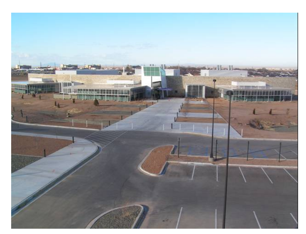
View of CORE – Almost Completed