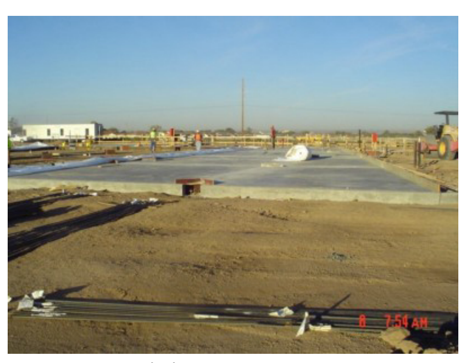
10/8/04 – View of Slab