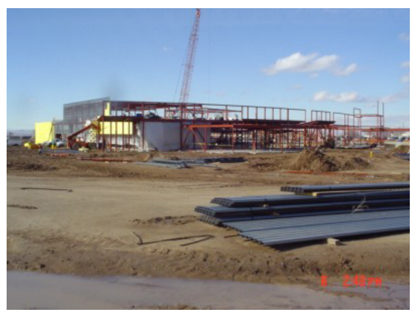
1/06/05 – View of Elevation