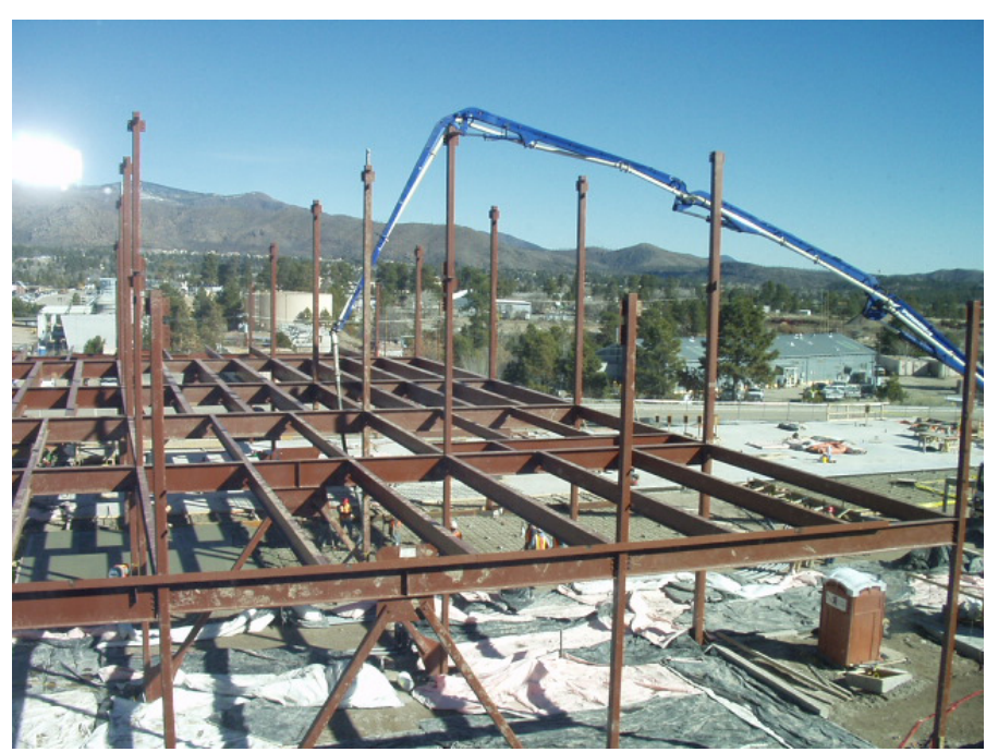
Pouring Concrete March 2005