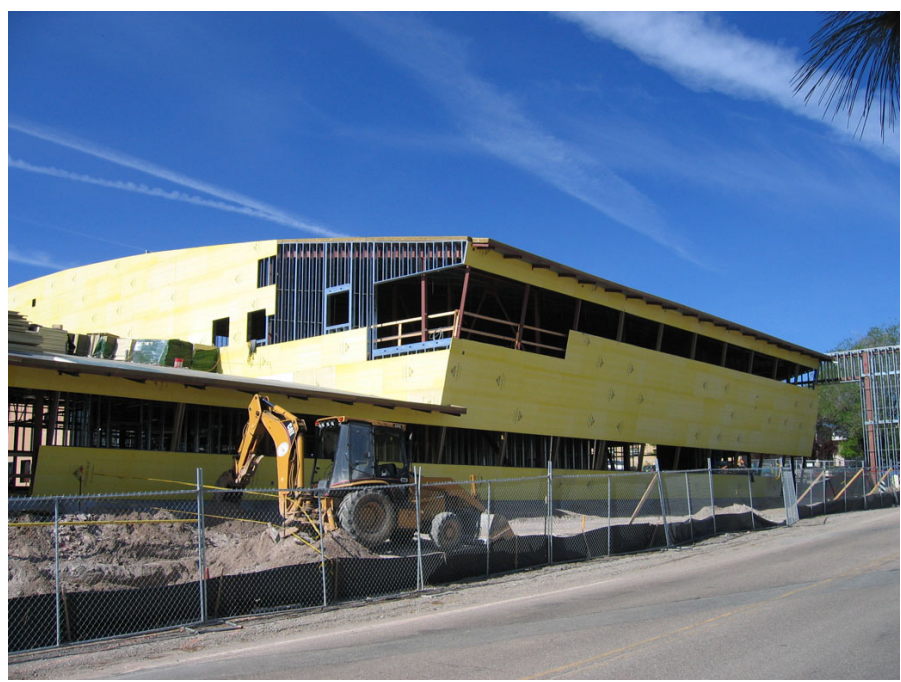
Second Floor Interior May 2005