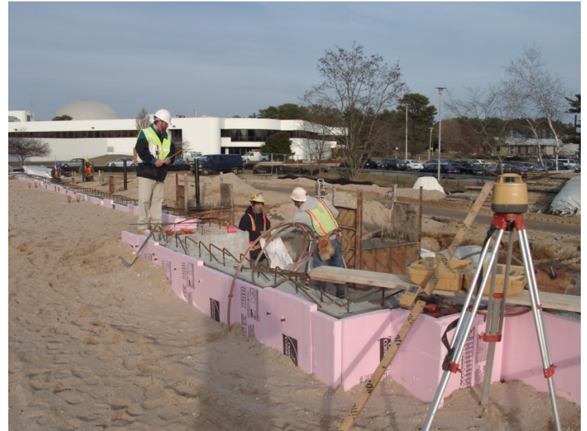
East Foundation Wall and Outside Spread Footing & Pier