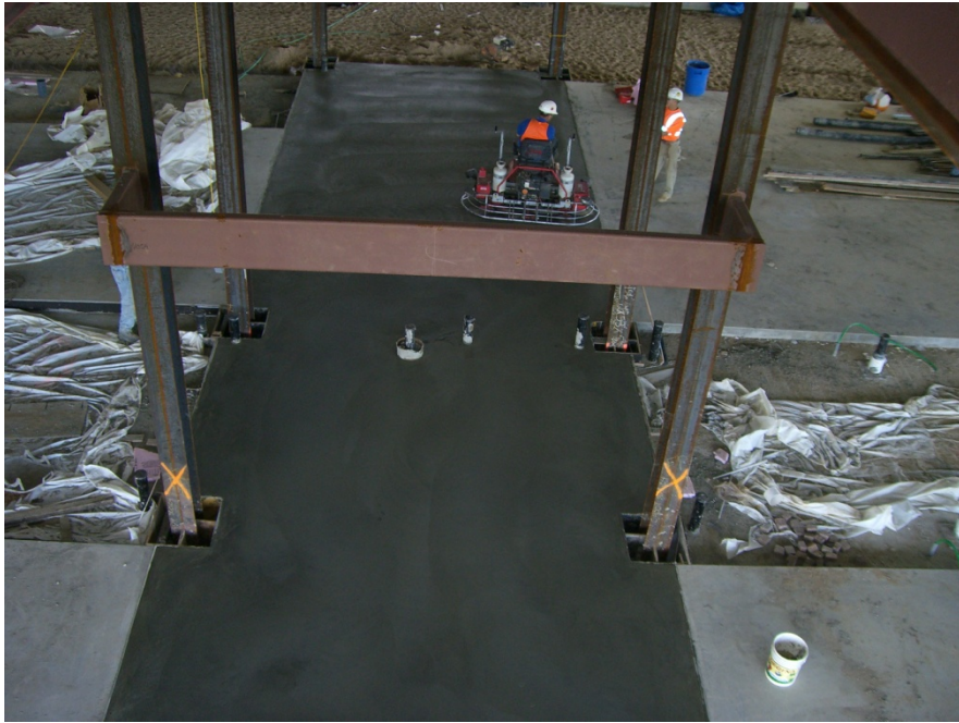
Concrete Finishing w/WhirlyBird