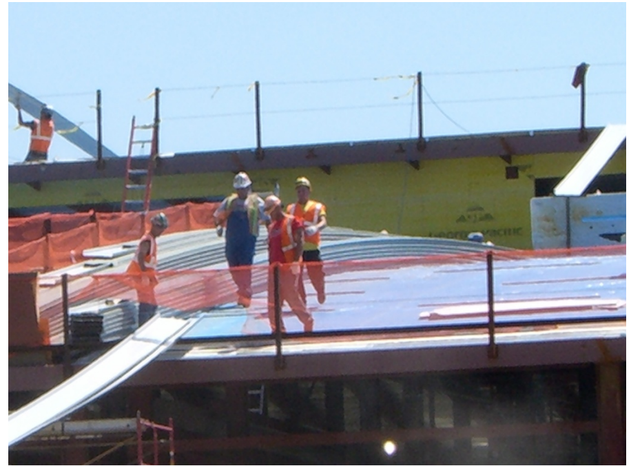
Moving Roofing Materials