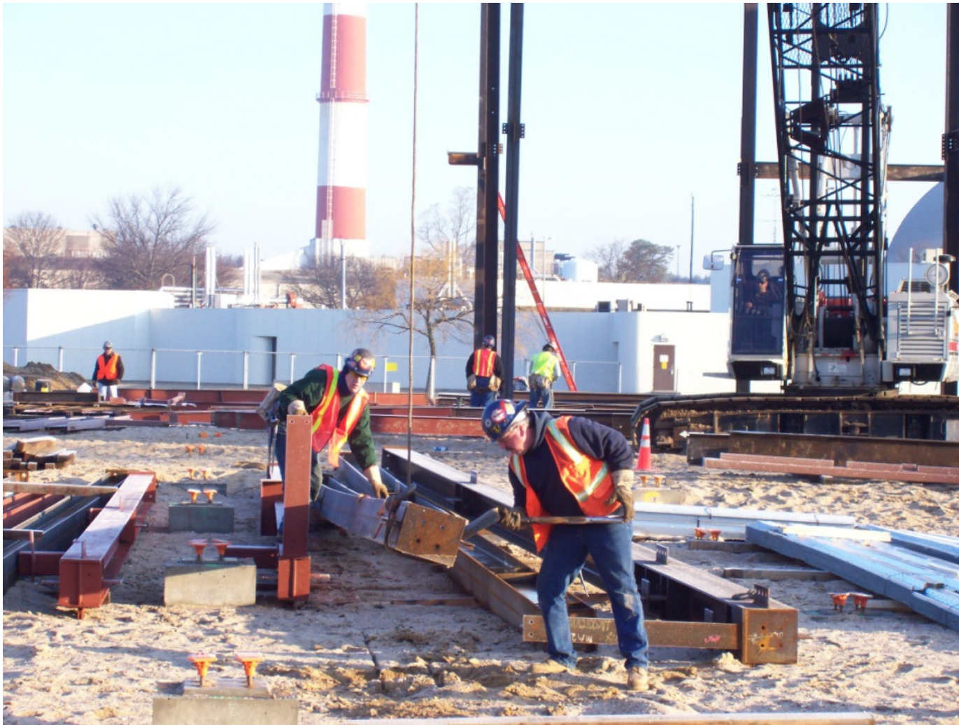
Lifting Steel Column 2006