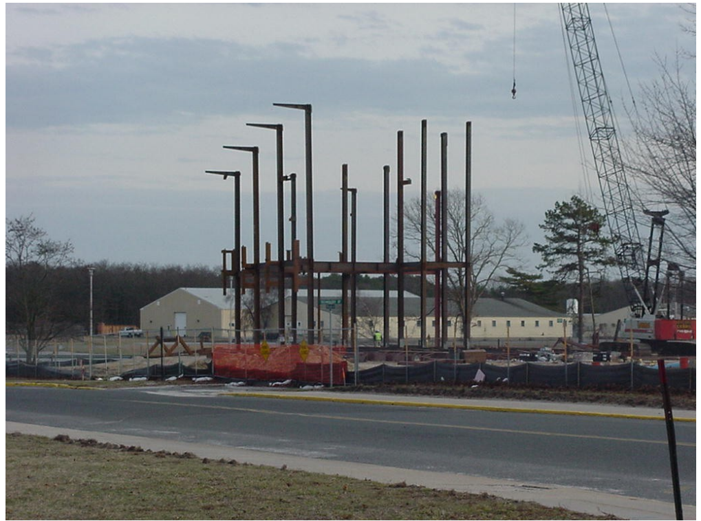
First Steel January 2006