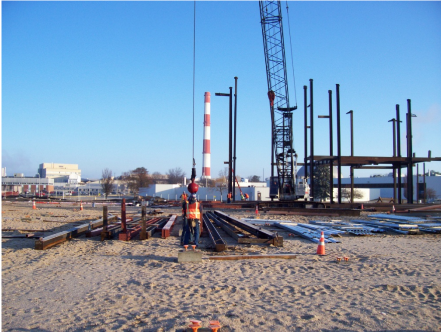
Another view looking North