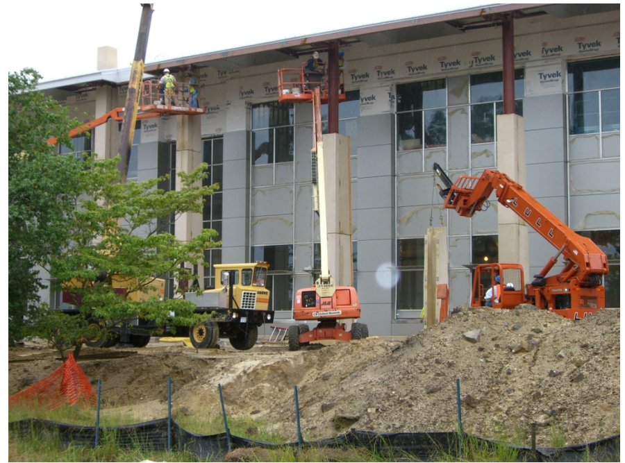
Concrete On Exterior Of Building