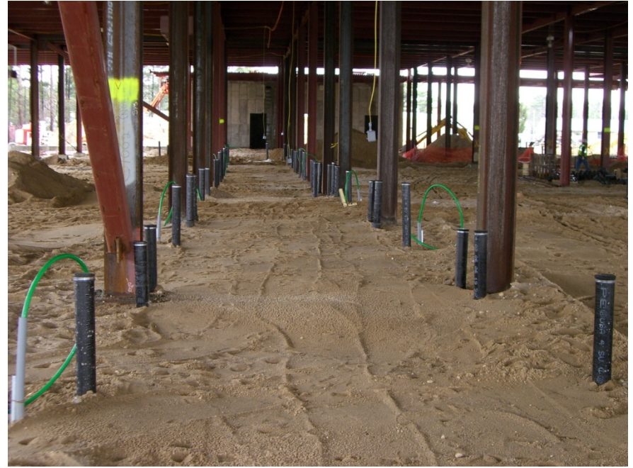
Gallery Floor Drain and Grounding