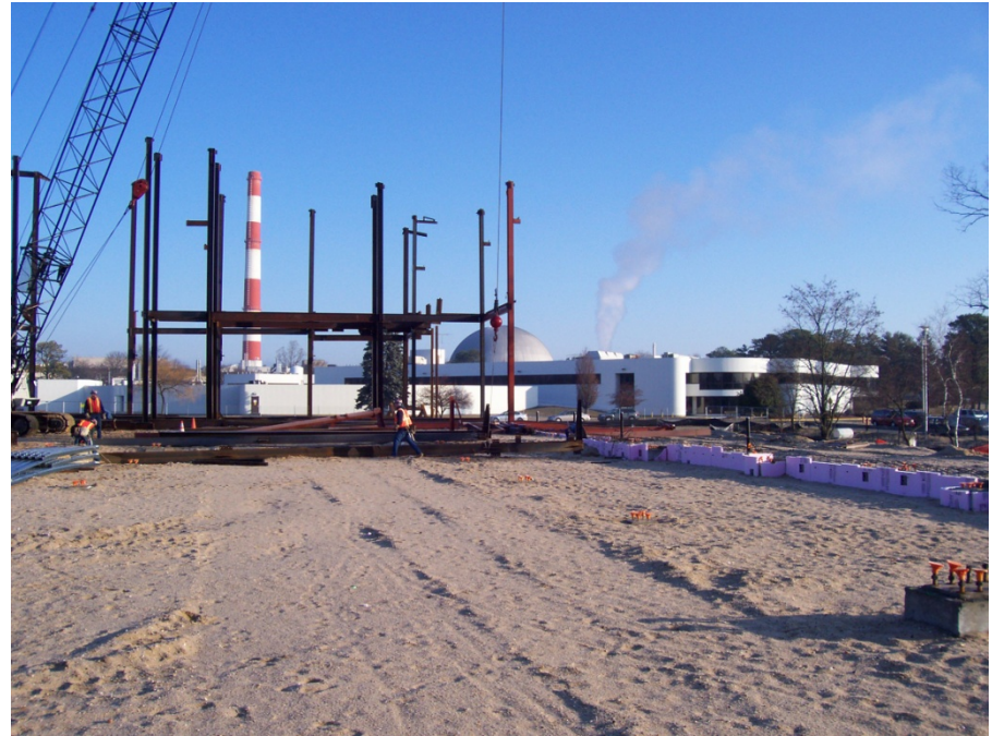
Another view looking North