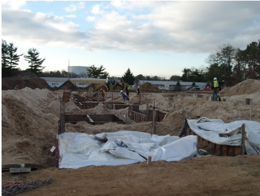
Footings & Reinforcing Work