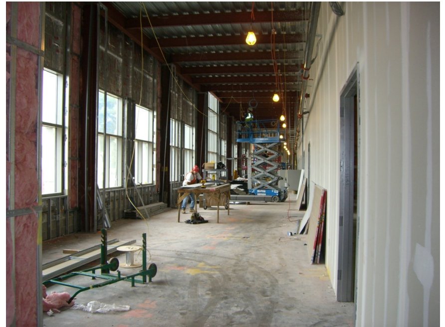
First Floor Preparing for Exterior Offices