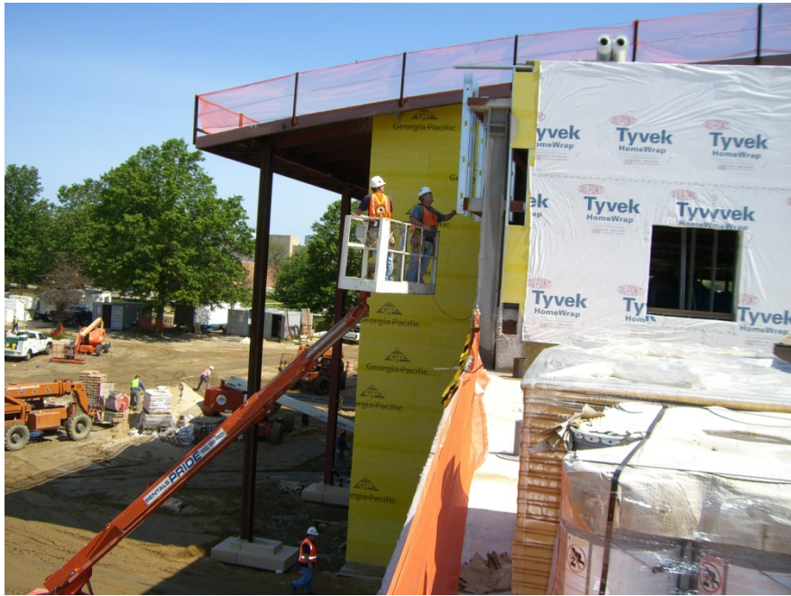
Exterior Stud Wall