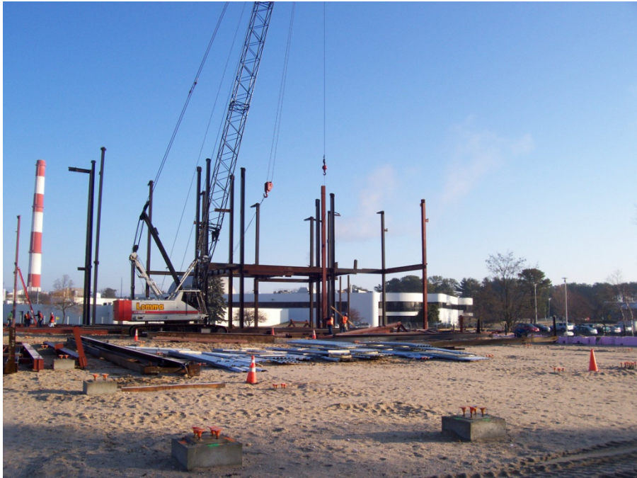
Another view looking North