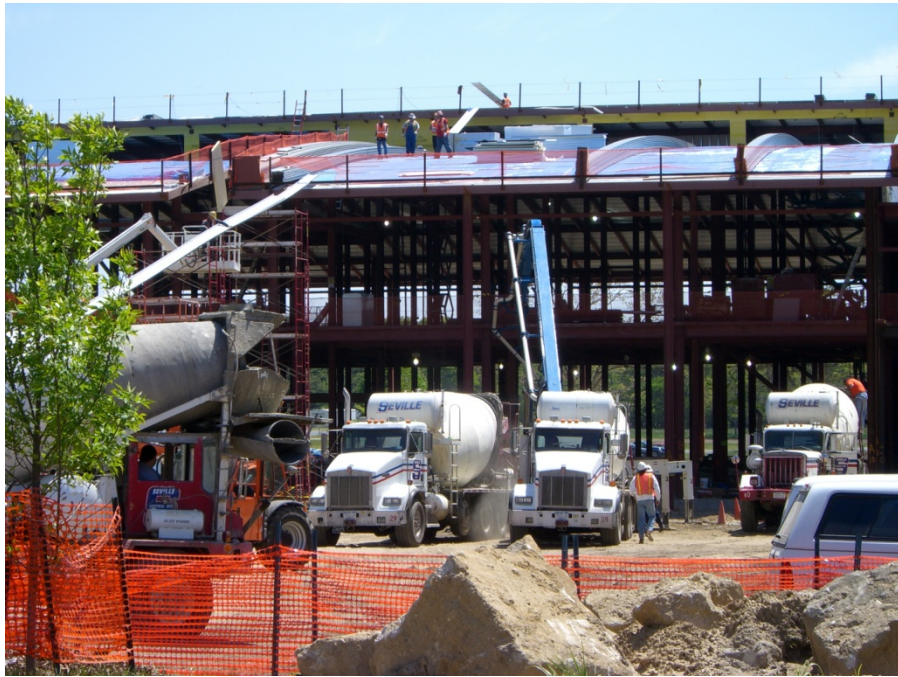
Ongoing Concrete and Roofing Activities