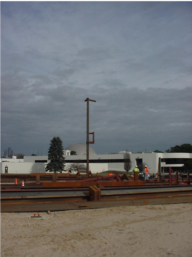
First Steel Column 2006