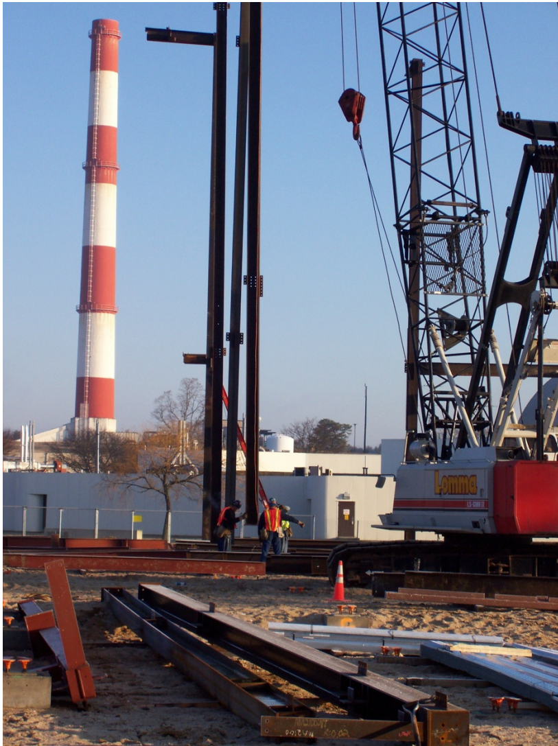
Preparing to Set Column