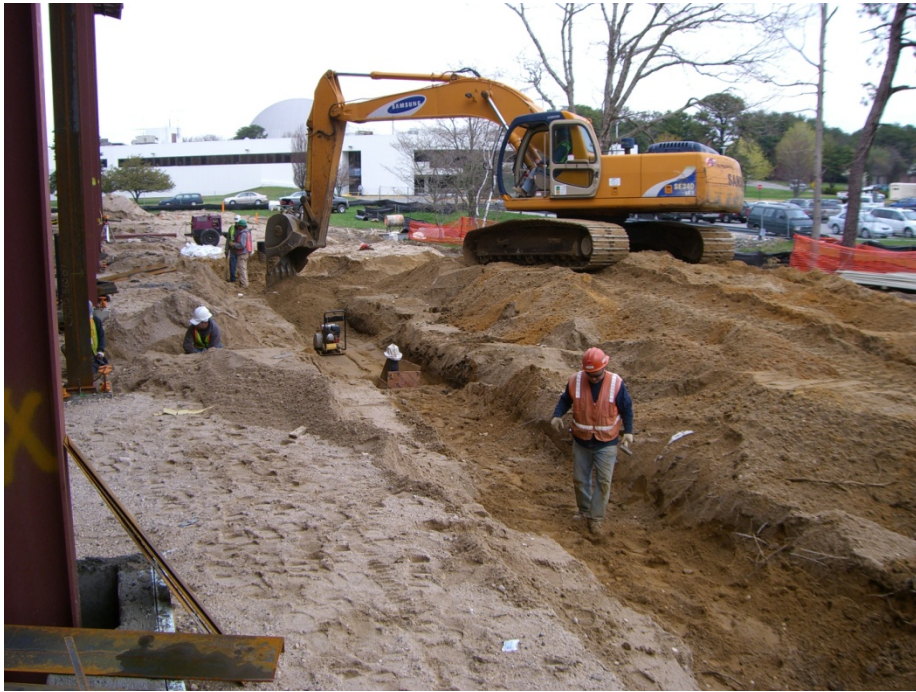
Backfill Storm Pipe