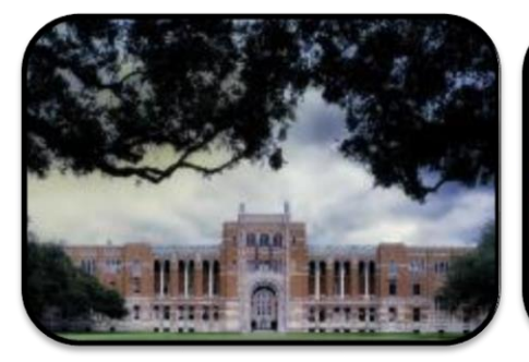
~38% of Research to Universities