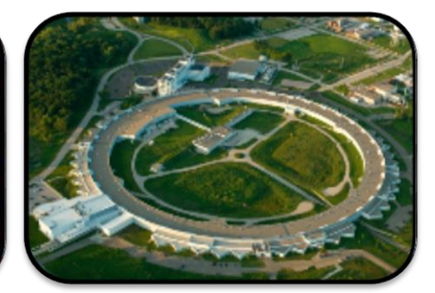
Facility Operations: 40.3%, $2.352B