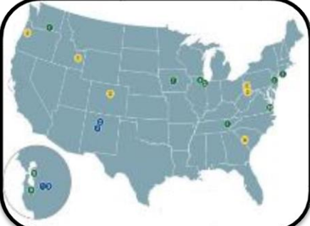
Funding at >300 Institutions, including 17 DOE Labs