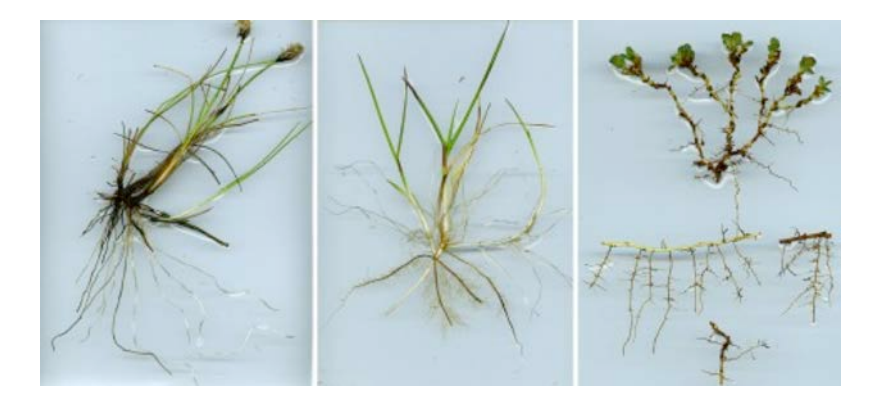
Figure 3. Variation in leaf, stem and fine-root traits among arctic plants growing on polygonal ground at the Barrow Environmental Observatory (BEO). L to R Eriophorum russeolum (sedge), Dupontia fisheri (grass), and Salix rotundifolia (shrub).

annually to the TRY database to facilitate aboveand belowground linkages. However, FRED also indicates that more observations of fine root processes are needed across the globe. Furthermore, even physiological processes as well-understood as photosynthesis