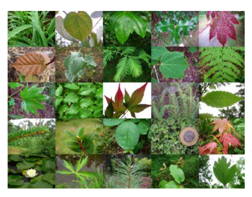
Figure 1. Variation in leaf size, shape, thickness and other properties.

Plant traits have long occupied a central role in ideas about plant physiological functioning. The large functional diversity of plants (Figure 1) is evident in looking across the world's ecosystems, which can be traced to the set of traits that govern this diversity. In particular, leaf traits such as its thickness, as expressed by the metric Leaf Mass per unit Area (LMA), or its reciprocal Specific Leaf Area (SLA), have long been a focus of studies on plant productivity (e.g. Blackman et al., 1919, West et al., 1920). Such traits govern a wide variety of plant process rates, and vary continuously across the enormous range of environments on Earth (Reich et al., 1997). Modern efforts to synthesize information on plant traits have led to the creation of large databases, such as TRY (Kattge et al., 2011), with which the relationships among plant traits, and between plant traits and the abiotic environment, may be identified. Such analyses led to