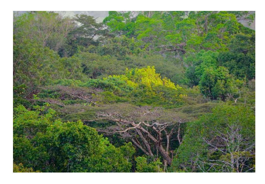
Figure 4. Tropical forest canopy near Manaus, Brazil.

and biomass (Malhi et al., 2004); these relationships may also be observed in the temporal response to global change (Brienen et al., 2015). Thus the current models, by focusing on the productivity response, may be effectively missing compensatory responses that will dampen